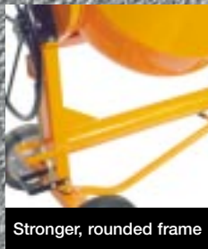
Stronger, rounded frame