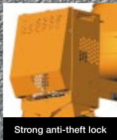
Strong anti-theft lock