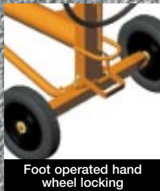
Foot operated hand wheel locking