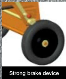
Strong brake device